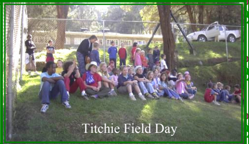
Titchie Field Day

If you are interested in having us come and speak at your church, please ask your pastor or missions director to email us at: dmtilly@kijabe.net