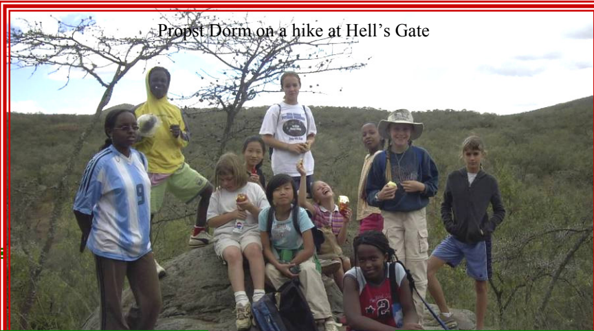
Propst Dorm on a hike at Hell's Gate