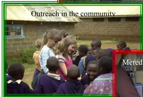
Outreach in the community