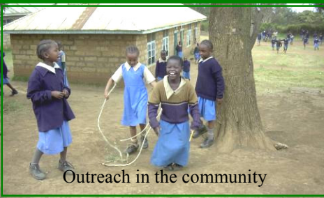
Outreach in the community

We want to thank all of you for all of the prayers and support that you continue to give towards our ministry here.